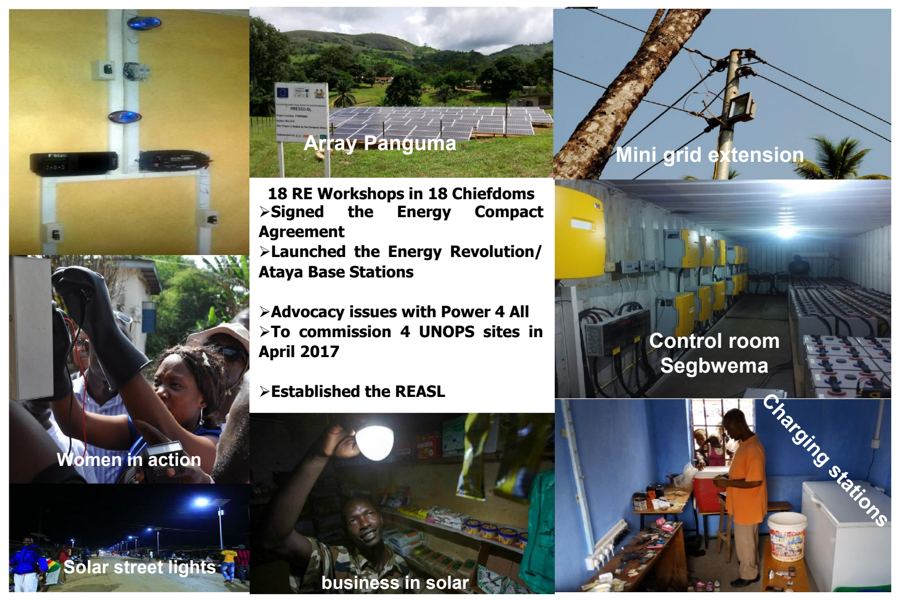
250,000 Solar home systems to be installed by end of 2017.