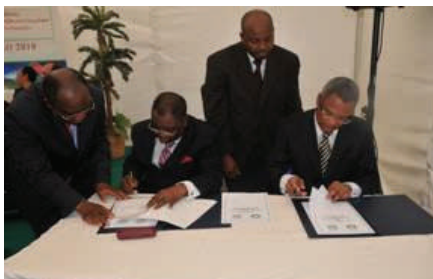
The Prime Minister of Cape Verde, and the President of the ECOWAS Commission, signing the Headquarter Agreement