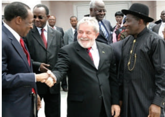
From the left, President Blaise Compaoré of Burkina-Faso, President of Brazil Luiz Inácio Lula da Silva and President of Nigeria Dr. Goodluck Ebele Jonathan exchanging handshake at the summit

The ECOWAS Brazil Summit was held on 3 rd of July 2010 in Sal, Cape Verde. At the Summit, ECOWAS and Brazil agreed on new initiatives that will boost their economic and political cooperation focusing on addressing the issues of poverty, food security, environment, renewable energy, capacity building and political dialogue.