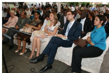
Other Government Delegates