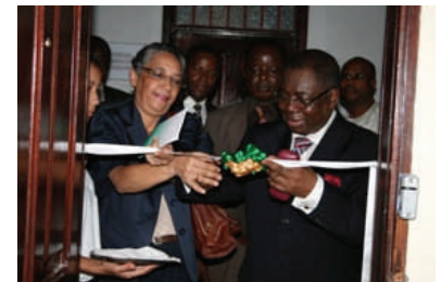
Cape Verdean Minister for Energy, Industry and Tourism and the ECOWAS President, cutting the ribbon to declare ECREEE officially open.