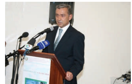
The President of the Canary Islands, H.E Paulino Rivero Baute giving a Speech at the inauguration