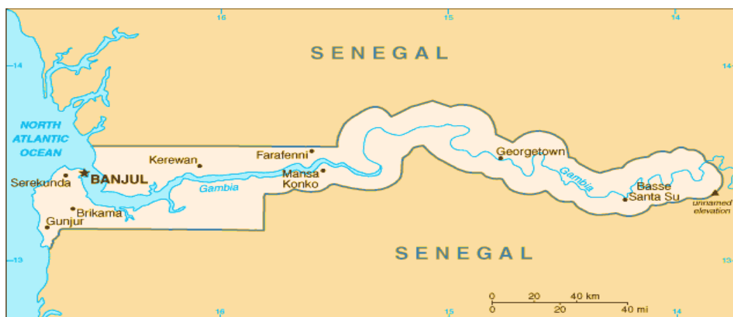
plate 1: Map of The Gambia

Economic growth is projected to be at 5.4% in 2019 and 5.2% in 2020 but will remain slightly below potential. This assumes a strong recovery in tourism and trade, a normal agricultural season, and improvements in electricity provision. Political stability, combined with improved macroeconomic conditions, would help strengthen investment activity. Economic activity would also be underpinned by key infrastructure developments, notably energy supply, as well as improved trade and re-export trade 1 .